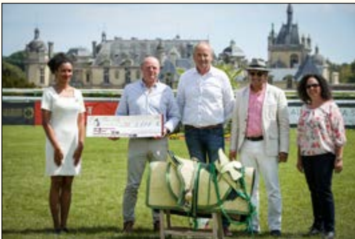
BEST BREEDER KNOCKE ARABIANS BELGIUM