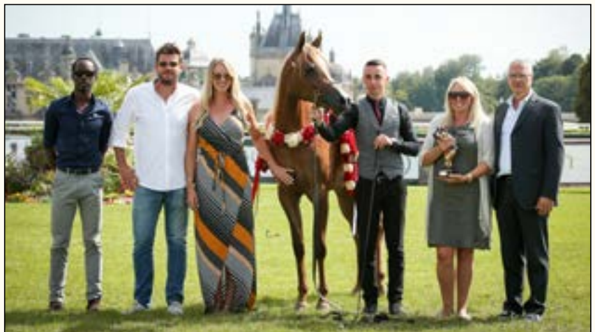
BEST IN SHOW FEMALE DELICIOUS KK KK ARABIANS