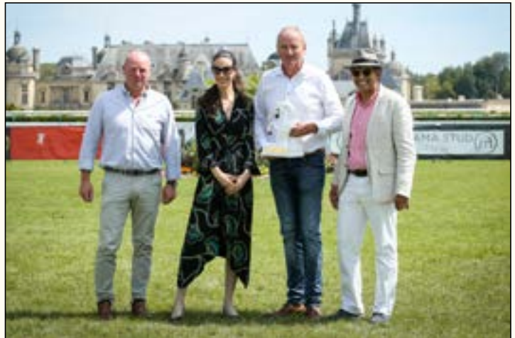
BEST SIRE QR MARC KNOCKE ARABIANS